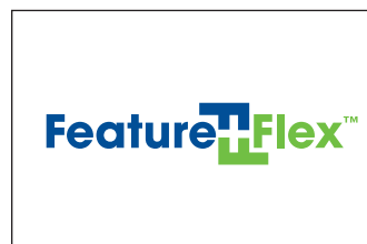
User Adaptable Solutions